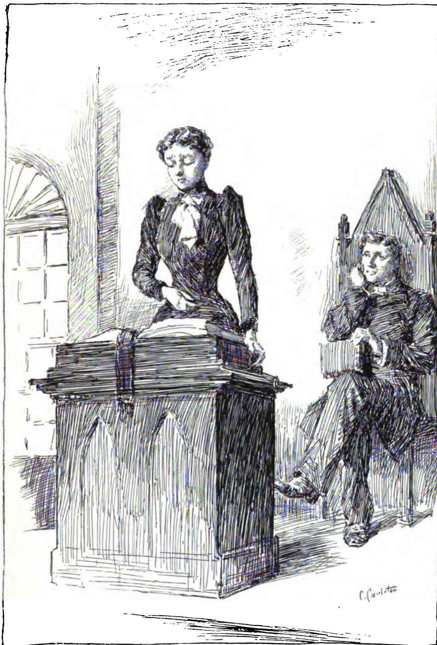
“AND ONE DAY HER HUSBAND’S LARYNX WAS NOT WHOLLY IN REPAIR.”